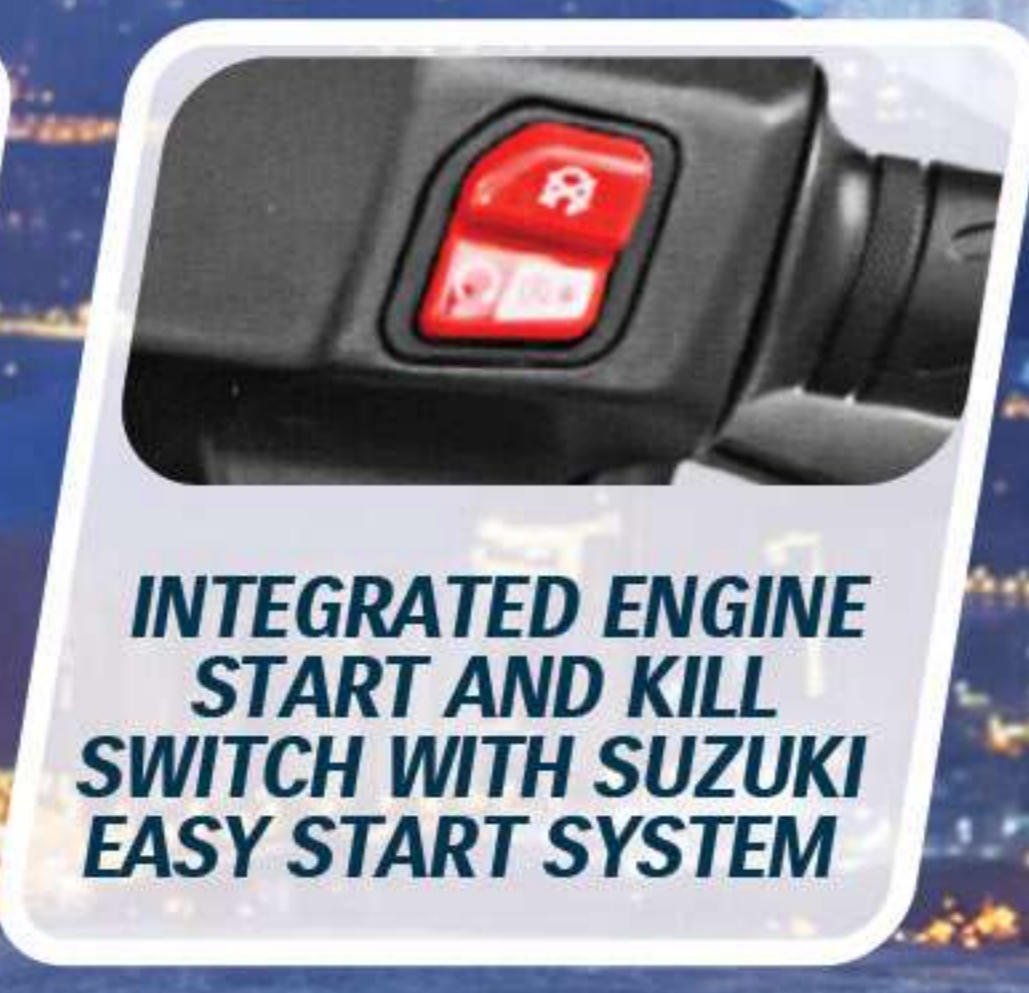
INTEGRATED ENGINE START AND KILL SWITCH WITH SUZUKI EASY START SYSTEM