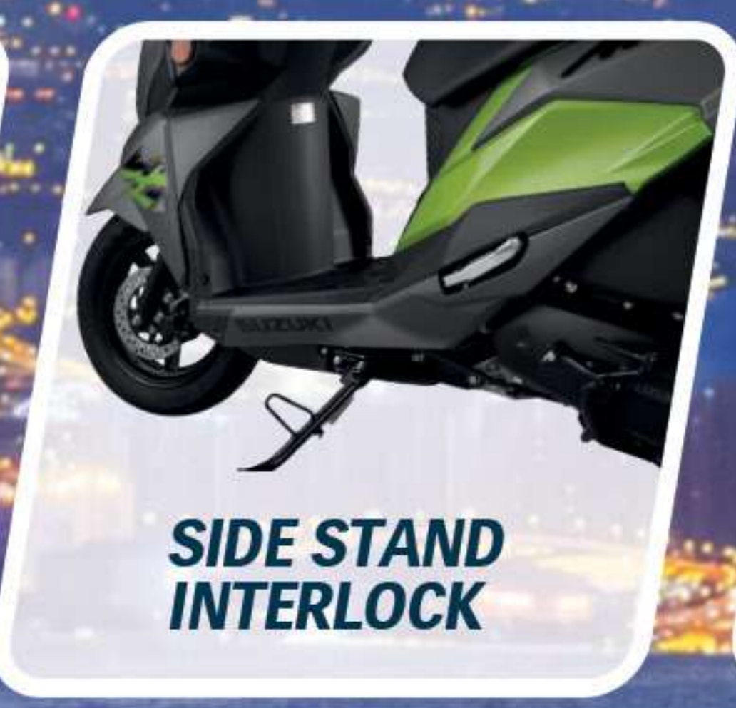
SIDE STAND INTERLOCK