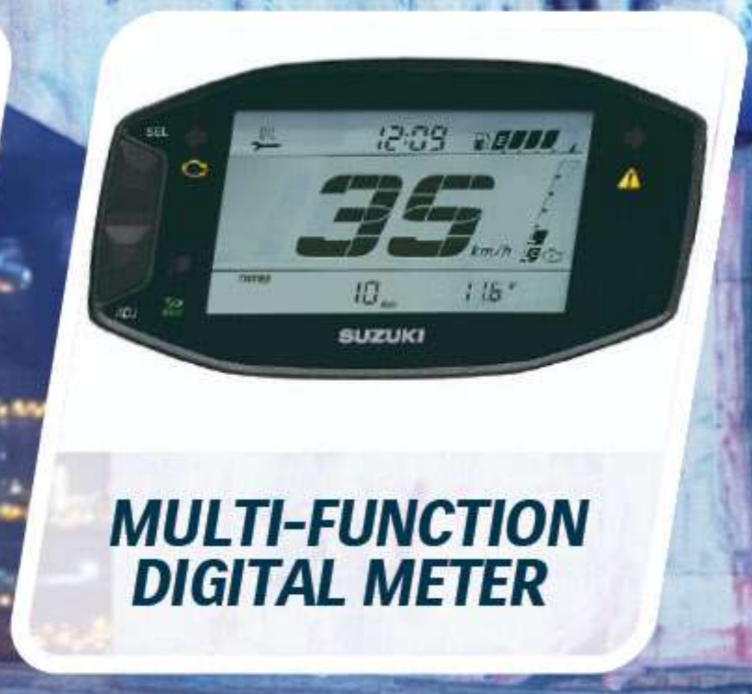
MULTI-FUNCTION DIGITAL METER