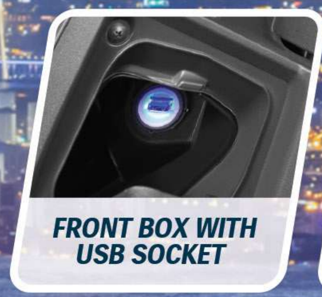
FRONT BOX WITH USB SOCKET