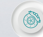
Front Disc Brake