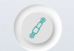
Telescopic Front Suspension