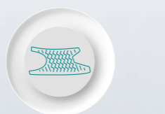
3D & Non-Slip Grids Floorboard