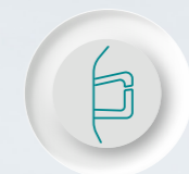
Dual Convenient Utility Hooks