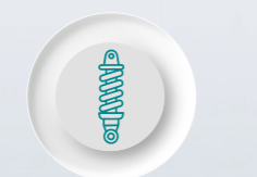
Swing Arm Rear Suspension