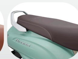
Seat Cover Dark Brown