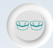
Dual Front Pockets