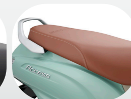
Seat Cover Brown