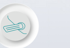
Aluminium Foot Rest