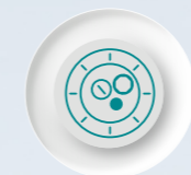
One Push Central Lock System