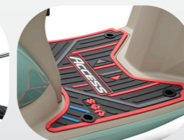
Floor Mat Black