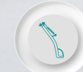
Side Stand Interlock