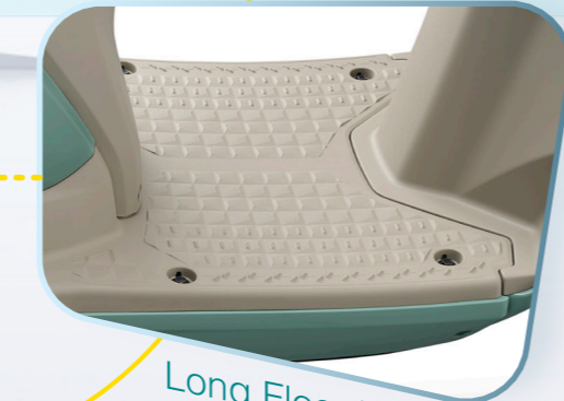
Long Floor Board