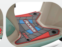
Floor Mat Red