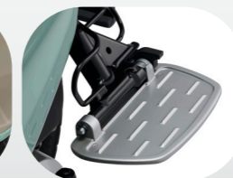
Rear Foot Rest