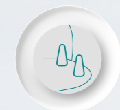
Dual Under Seat Utility Hooks