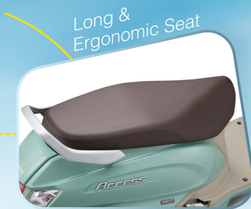
Long & Ergonomic Seat