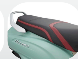
Seat Cover Maroon