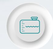
5.3 L Fuel Tank Capacity