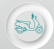
Classic Urban Styling