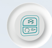
Engine Start & Stop Switch with Suzuki Easy Start