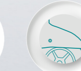
Steel Front Fender & Leg Shield