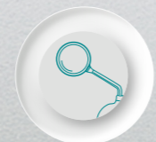
Chrome Finish Mirrors